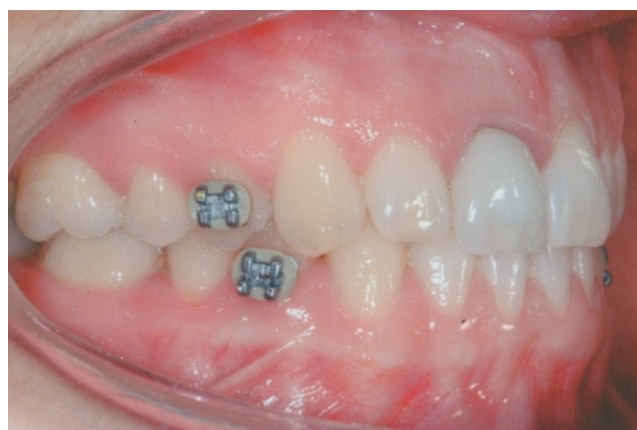
Fig. 1 Brackets positioned on the premolars, with fluoridated elastomers in place.

Each subject had an orthodontic bracket (GAC international, Inc, 185 Oval Drive, Islandia, NY 11749) placed onto a premolar in each quadrant (Figure 1). Standard methods and materials were used to place the bracket, including the use of 30 per cent phosphoric etchant gel to treat the surface of the premolar. They were attached with a non-fluoride leaching composite bonding cement (Rely-a-Bond®, Reliance Ortho Prod. Inc., Itasca, IL, USA). Following bracket placement the subjects were given oral hygiene instruction. All subjects were asked to maintain good oral hygiene for the duration of the study.